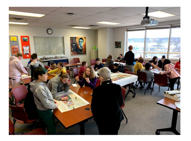
Figure 2 - Project teams busy at work on their park concepts.

when I bogged them down with my slide on state regulations and the licensure process. I really don't know what I was thinking there... KNOW. YOUR. AUDIENCE. That was the defining moment when all 23 sets of prying eyes shifted their gaze from one of engagement and politeness to glazed-over expressions (and quite possibly contempt). I had to recover quickly because I was losing them fast. I forgot what I had prepared in the presentation past that point but I abandoned it in favor of starting the chip game park design activity.