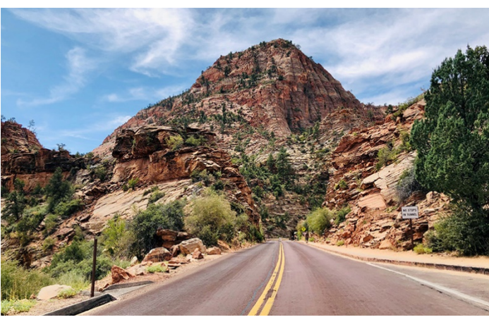
(Above) Zion National Park. Springdale, Utah

https://www.asla.org/land/LandArticle.aspx?id=58003