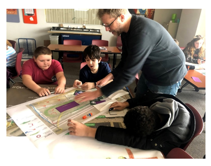
Figure 3 - Providing a desk critique to a project team while working around the sleeping student.

to incorporate on a printed base map of a park site. I did my best to outline how the unique opportunities and constraints of the project site might impact their decisions about where to place programmatic items. The class as a whole, responded really well to this exercise but I was especially proud of the way they embraced what I instructed them in that good design is a product of a justifiable and defensible rationale behind every move. Each group thought critically about site relationships and gave good responses as to why it makes more sense to locate a drinking fountain near athletic courts, restrooms near picnic shelters, etc., even though groups may have missed the mark by placing structures on steep slopes or in some cases, across the street from the project boundary. We only had enough time for a few groups to pin up their work when the bell rang.