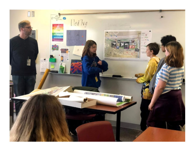
Figure 4 - A project team presenting their concepts to the class. (A little biased towards this one because the girl in the blue sweatshirts is my daughter).

I can't describe how shocking it was that several hours had elapsed seemingly instantaneously. They actually gave me an enthusiastic round of applause (which awakened the sleeping student) and they moved on to their next class. The highlight of the day however was when a student approached me afterward expressing a general interest in the profession. I provided her with some more info on software programs I use, where I went to college, etc.