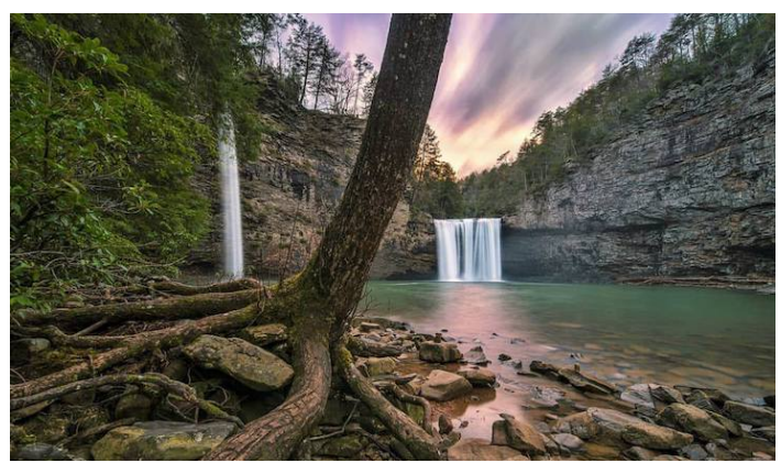
(Above) Cane Creek Falls at Fall Creek Fall State Park

https://www.asla.org/land/LandArticle.aspx?id=58003